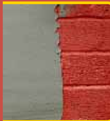
Perfect rendering when applied over 507 Rendagrip