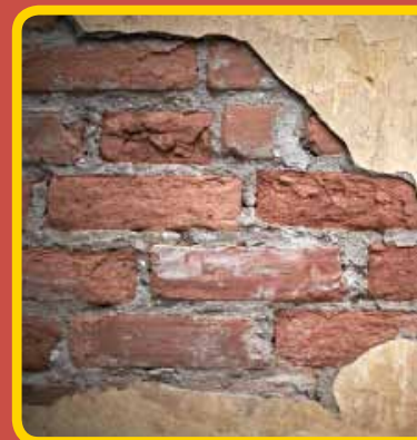
Cracked broken rendering when applied onto bare brick