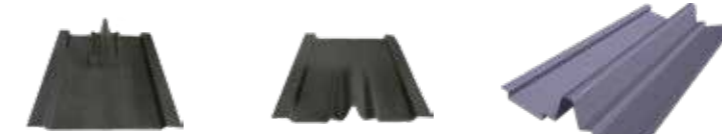
Eaves Closure Piece