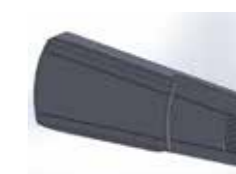
Dry Verge Unit