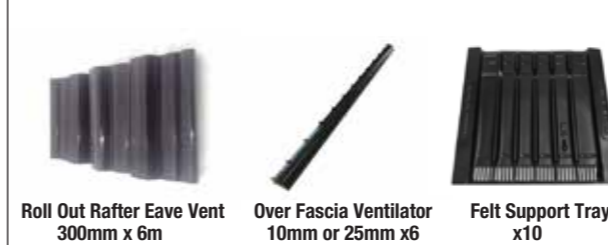
Roll Out Rafter Eave Vent 300mm x 6m