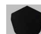
Multi Ridge End Cap