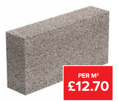
65mm Olde Whittington Blend Solid Dense 440x215x100mm 7.3N Concrete Block BLLBSD10EA