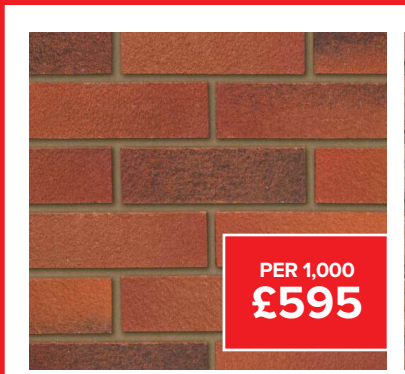
65mm Alderley Russett Brick BKOLAR65